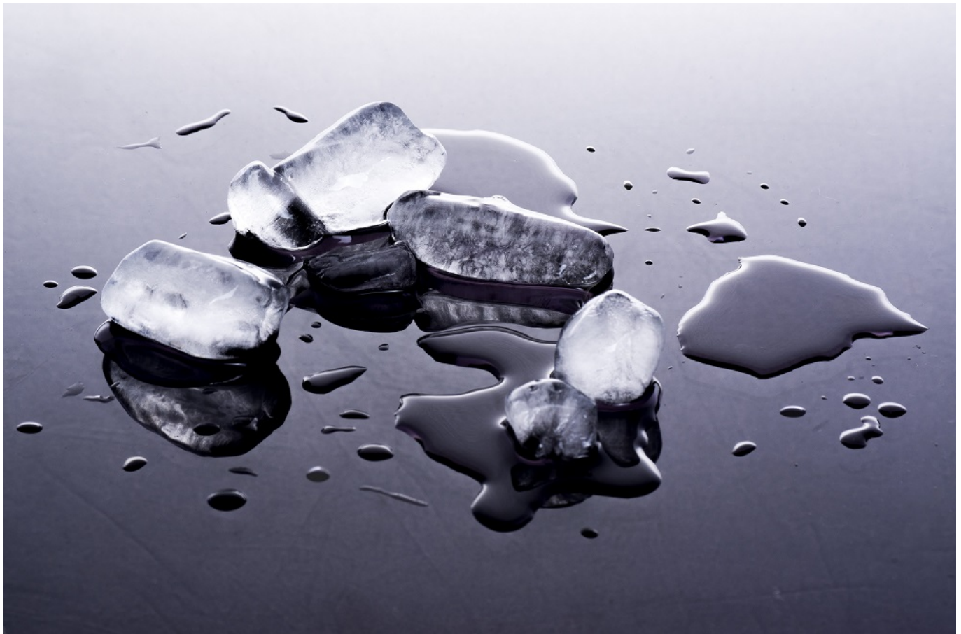
Figure 3. Ice melting is an example of a thermal phase transition

Curiously, there are phase transitions that occur at zero temperature (by changing another parameter, such as pressure). These transitions cannot be driven by thermal energy, because at zero Kelvin the thermal energy is zero. Instead, these transitions are called quantum phase transitions because they are driven by quantum-mechanical fluctuations , which in turn stem from Werner Heisenberg's uncertainty principle . The zero-temperature transition point is called a quantum critical point.