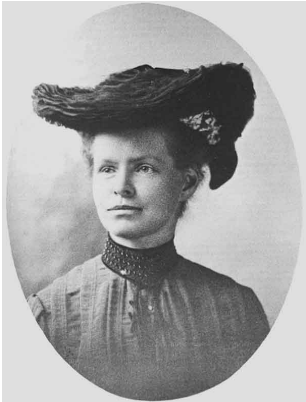
Figure 1. Nettie Stevens.

The possibilities are endless and had baffled scientists for centuries. While Hippocrates thought that the vigour of the parents was the main factor, Galen in the 1 st century stated that cells from the right ovary produced males while those from the left produced females. There were several other outrageous theories – of course, they seem outrageous now but were accepted as scientific explanations when they were first proposed. Notably, Aristotle thought that the sex of the fetus depended on the temperature of the father’s sperm during ejaculation. And a common legend even stated that it depended on the phase of the moon, the direction of the wind and even the time of day during fertilization!