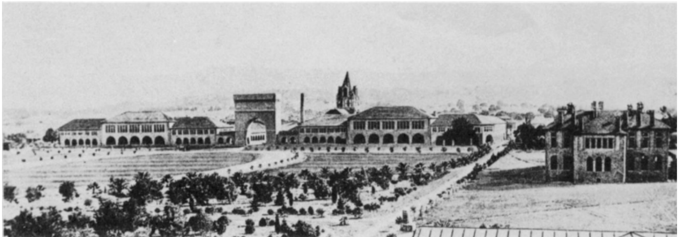
Figure 2. Stanford. The North Facade at Stanford University.

studied various insects and discovered unequally sized chromosomes.