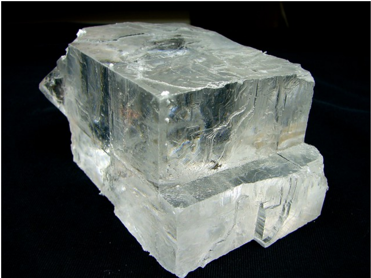
Figure 2. Halite. Halite (rock salt) is one type of mineral that could contain signs of neutrino's passing through it.

Universe. Therefore the effects of supernovae are of primary importance in understanding the development of the structures that host our own solar system.